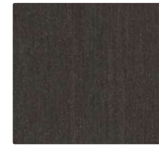
Black Birchply N C

Legend N Natural Finish F Flint Finish NU Nuance Finish C Chalk