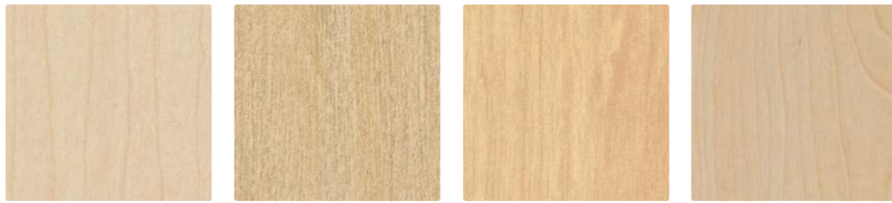
Dansk Maple F