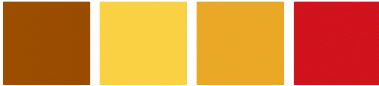
Moroccan Clay F