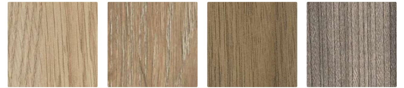
Classic Oak N NU

Legend N Natural Finish F Flint Finish NU Nuance Finish C Chalk