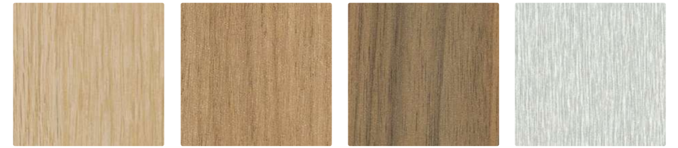
Calm Oak N C