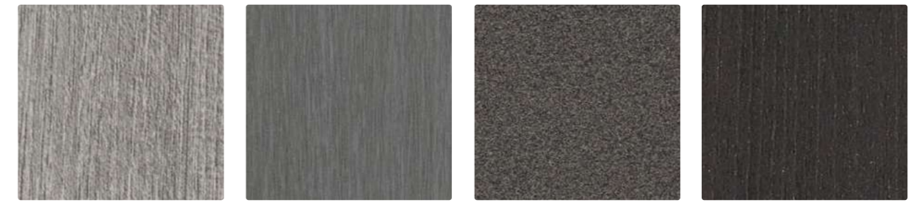
Fox Teakwood N