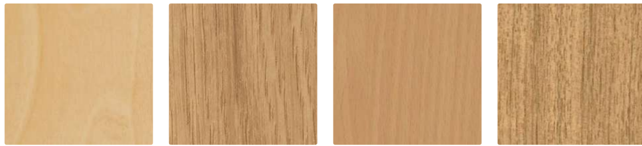
Curly Birch F